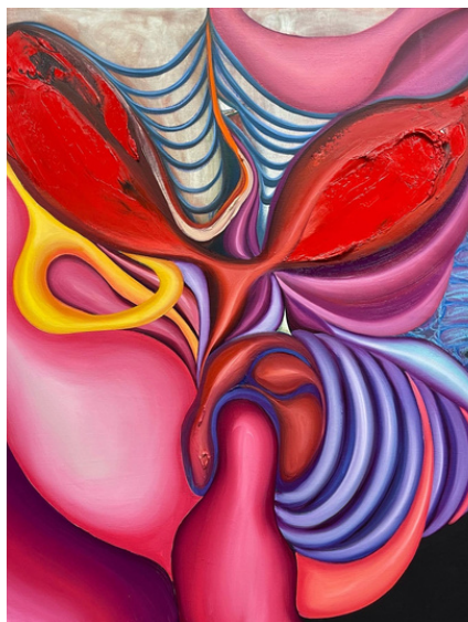
Anna Kostritskaya Connection (2022) oil on canvas 110 x 90 cm